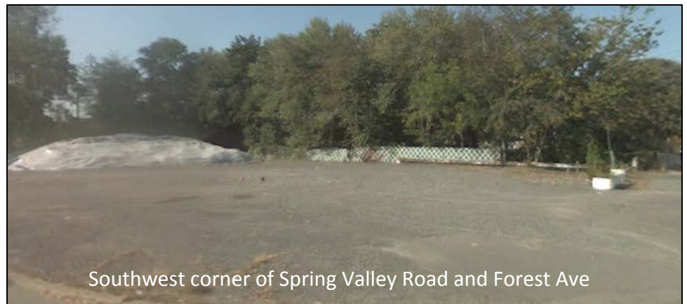
Southwest corner of Spring Valley Road and Forest Ave