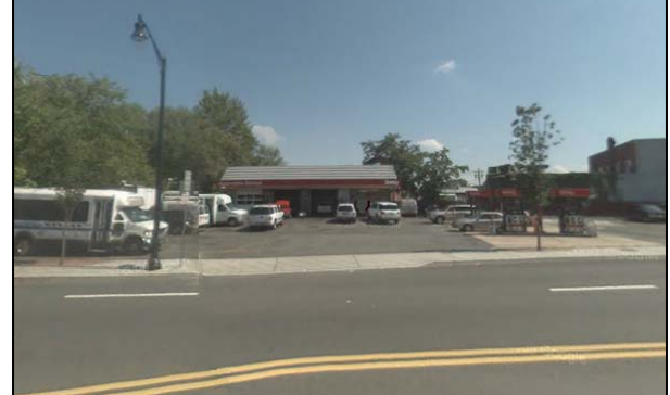
Northeast Corner of Main St. & Union St.